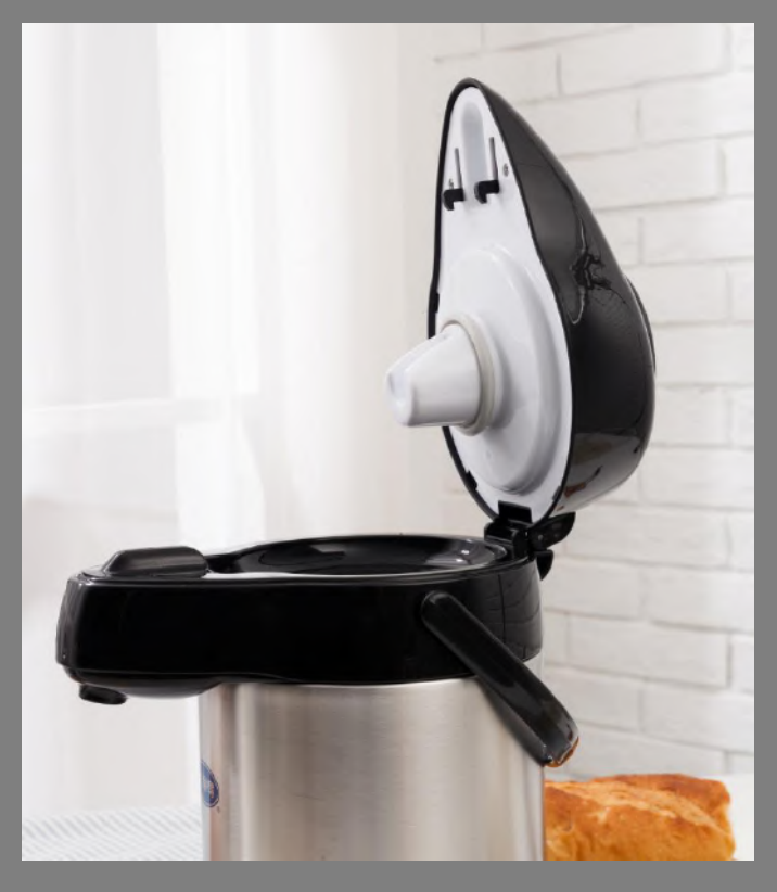
Durable pot lid, easy to clean